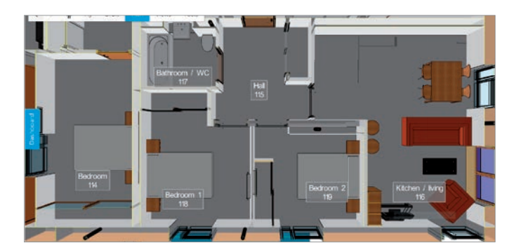
3D visualisation of spaces in Plan view with on-screen scale