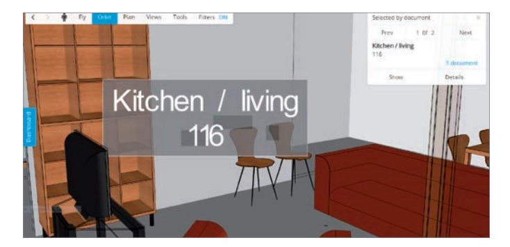
Focus on a space and quickly find and open linked documents

Deploy a simple-to-use SaaS solution across desktop and mobile for office and site use. Make project data available anytime, anywhere – and add users easily.